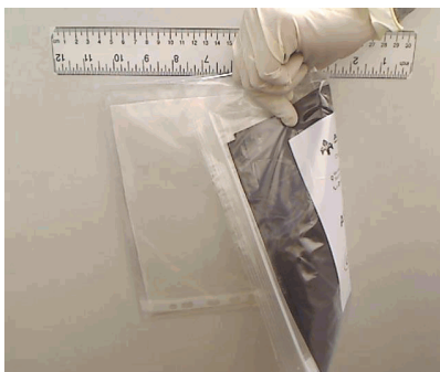
View of content