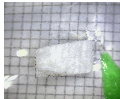
12.4mg analyzed (1mm x 1mm scale)

Disclosures: All work was done at Beta Analytic in its own chemistry lab and AMSs. No subcontractors were used. Beta's chemistry laboratory and AMS do not react or measure artificial C 14 used in biomedical and environmental AMS studies. Beta is a C14 tracer-free facility. Validating quality assurance is verified with a Quality Assurance report posted separately to the web library containing the PDF downloadable copy of this report.